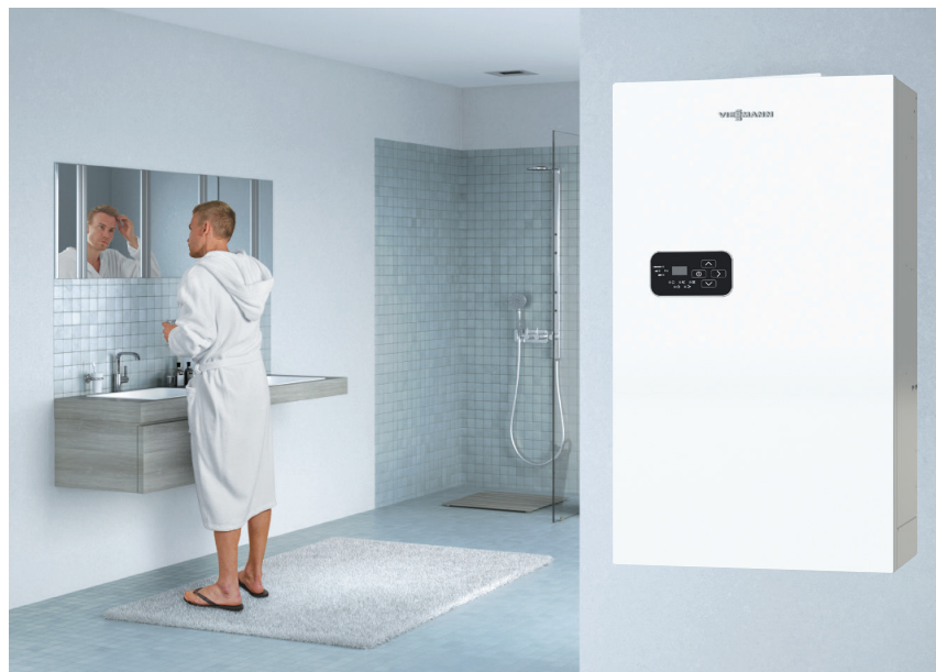
Vitotron 100, VLN2 electric low temperature heating boiler* is environmentally responsible and efficient heating source.

The Vitotron 100 is the easiest way to add hydronic space heating to new and existing systems, with a space saving design and integrated components for a fast and simple installation.