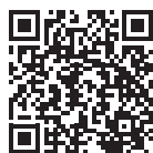
Watch Filter Airflow and Pressure Drop Demo