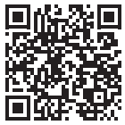
Watch how the Lennox PureAir™ S works.